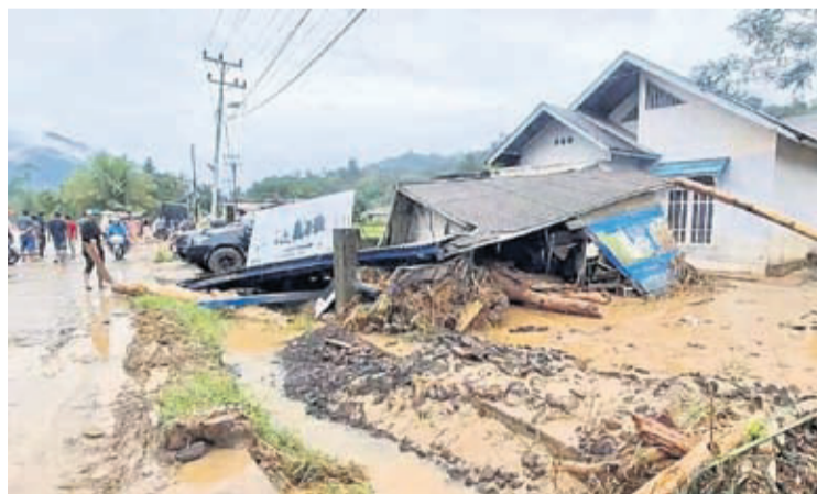
In this image made from video, damaged houses are seen in a village affected by flash flood in Langgai, West Sumatra, Indonesia, Sunday, March 10, 2024.

In February, Henry agreed to hold a general election by mid-2025, and the international community has tried to find some foreign armed force willing to fight gang violence there. □